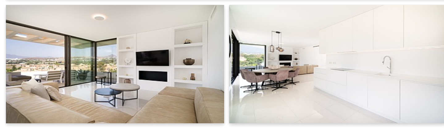
Exceptional modern 3 bed duplex penthouse apartment in Atalaya – Estepona